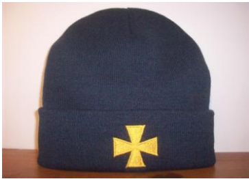
KES Beanie Hat