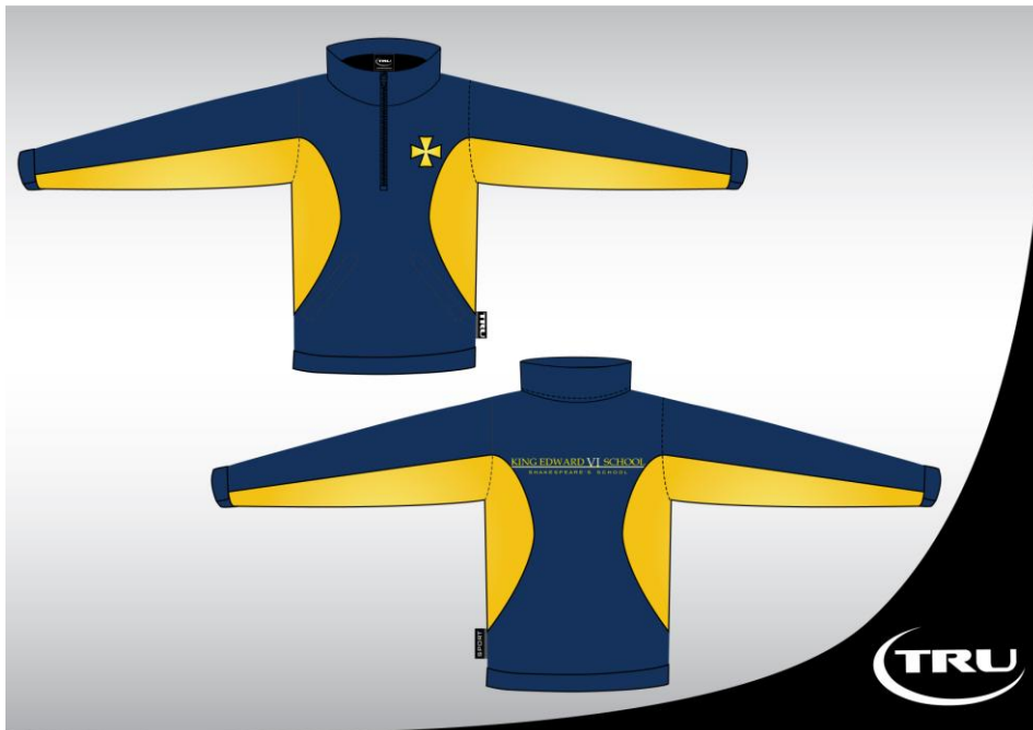
KES Training Top