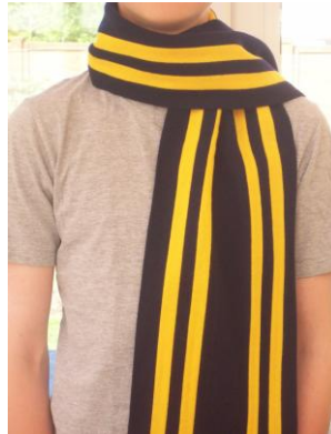
KES VI Form Scarf